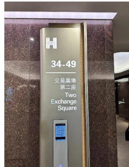
Step 4 Elevator to the 40th floor