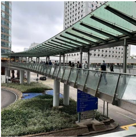
Step 1 Pedestrian Bridge

Enter HKU MTR station and take the Island Line to Central station . Exit from Exit A and take escalator to the pedestrian bridge. It takes 5min to walk to Two Exchange Square and HKU-iCube is on the 40th floor.