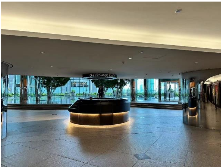
Step 3 Turn left at One Exchange Square